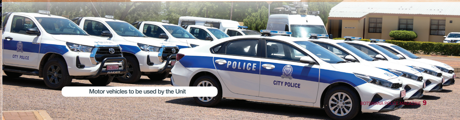
Motor vehicles to be used by the Unit