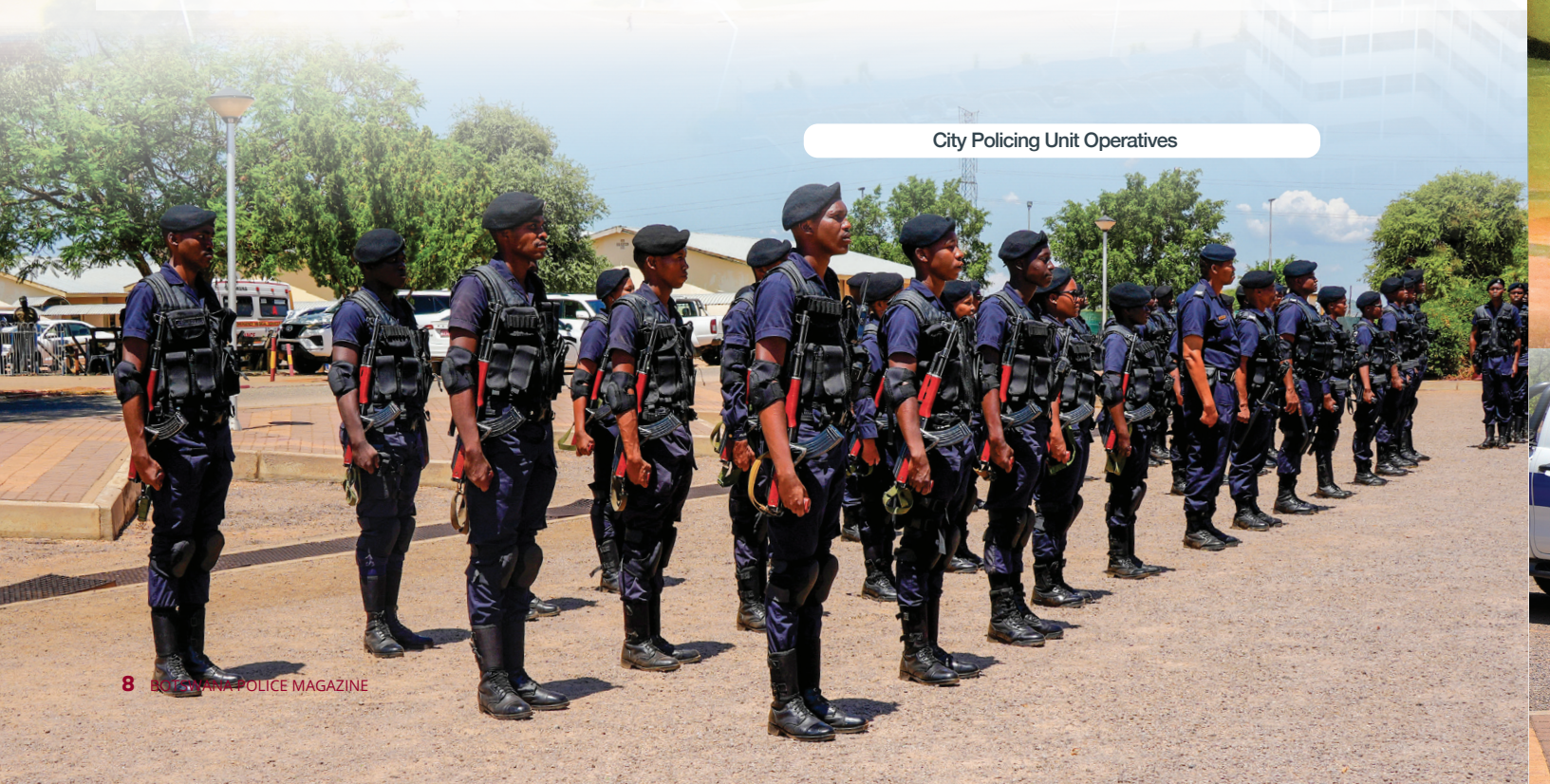
City Policing Unit Operatives

Honourable Mmusi officially launched the Unit recently in Gaborone, promising