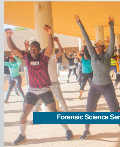
Forensic Science Service