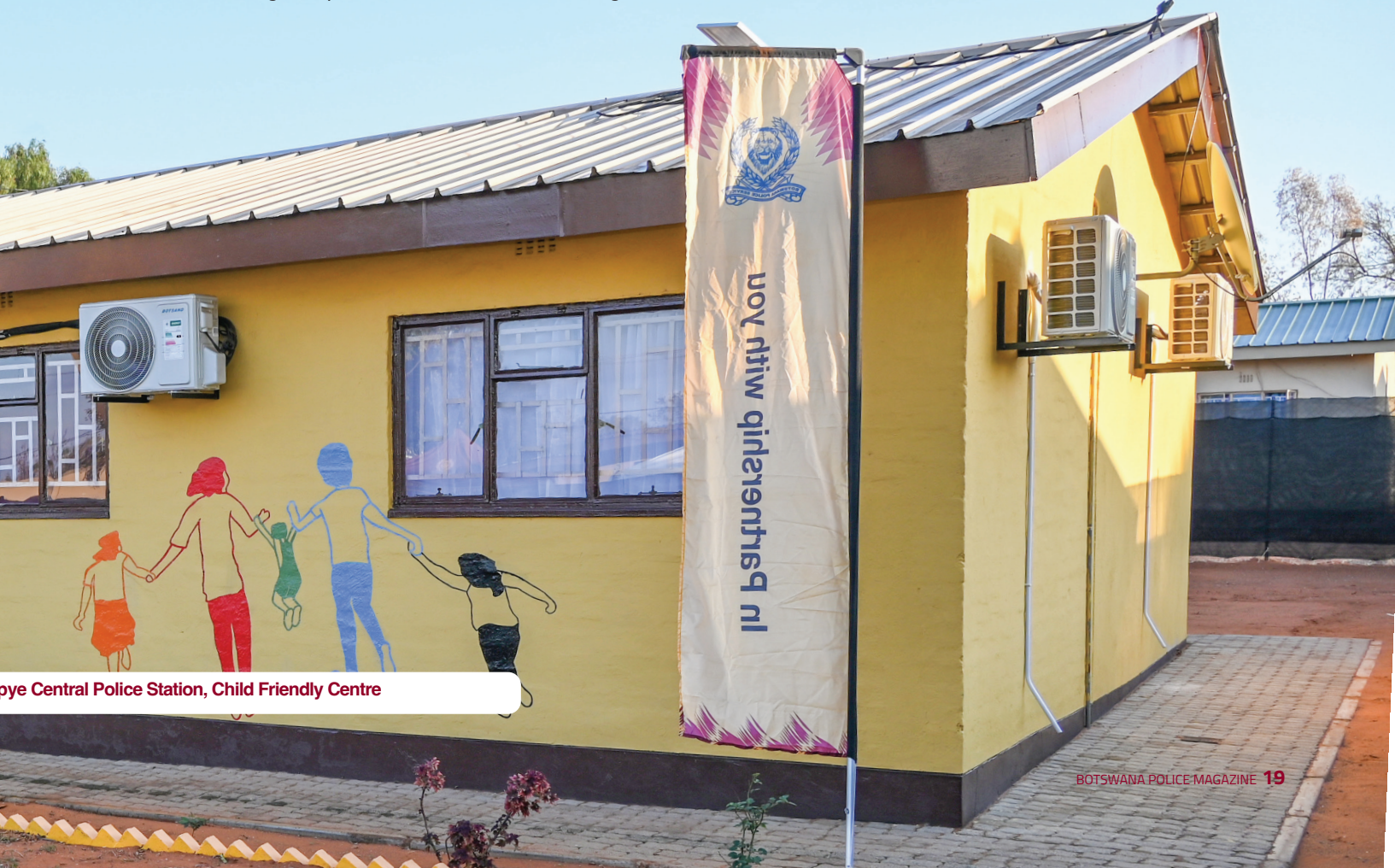
Palapye Central Police Station, Child Friendly Centre

The tribal leader went on to implore parents, teachers and guardians to monitor children's use of social media and technology as children continue to be victim of both cyber bullying and exploitation in the cyber space.