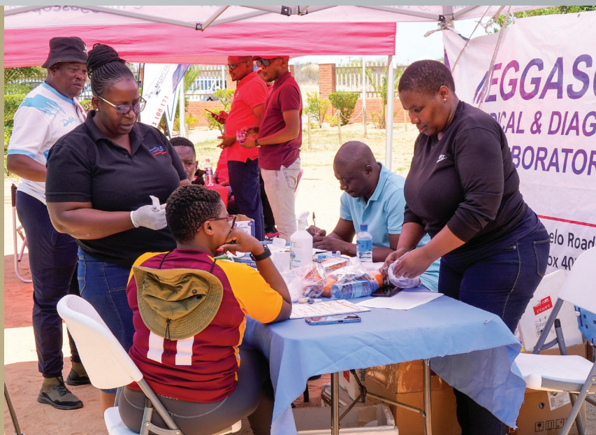
North Central Division officers doing health screening tests