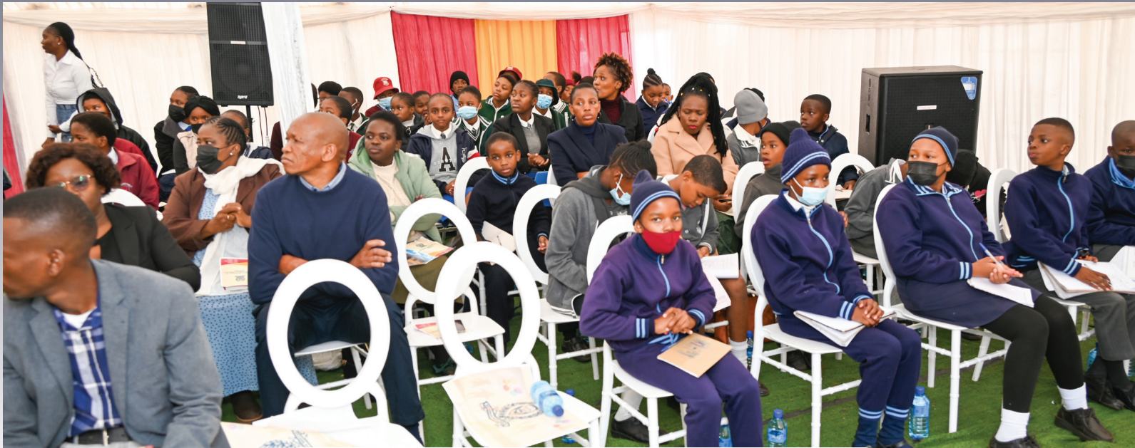
Some of the people who attended the event

BPS. Deputy Commissioner went on to highlight that the establishment of these CFCs were made possible through partnership with UNICEF, British and Japanese governments.