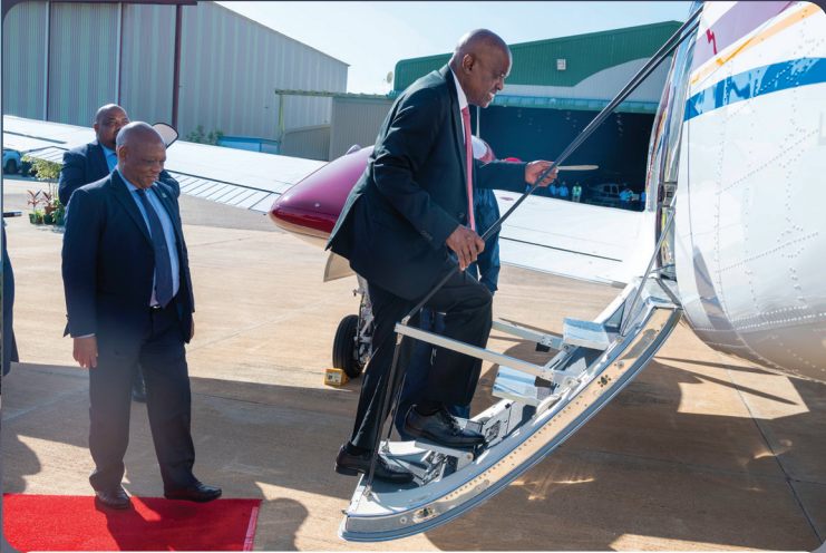
His Excellency the President, Dr Mokgweetsi E. K. Masisi appreciating the aircraft