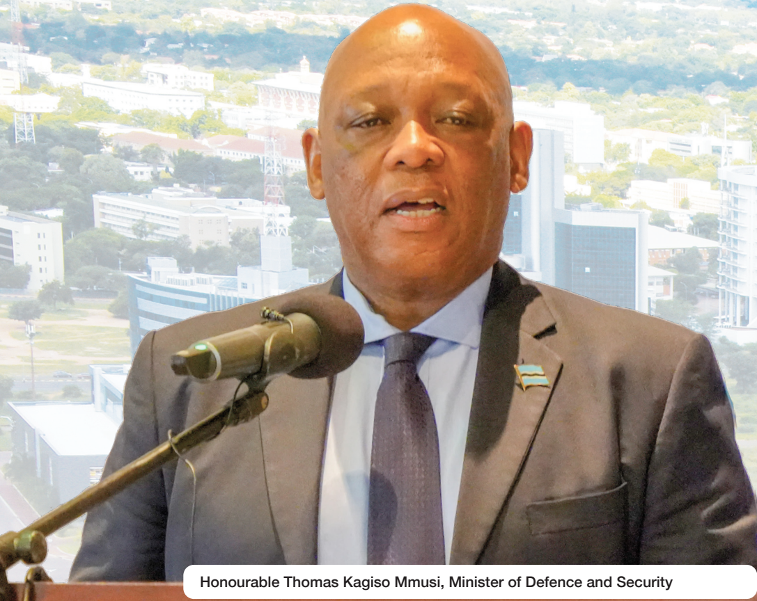
Honourable Thomas Kagiso Mmusi, Minister of Defence and Security