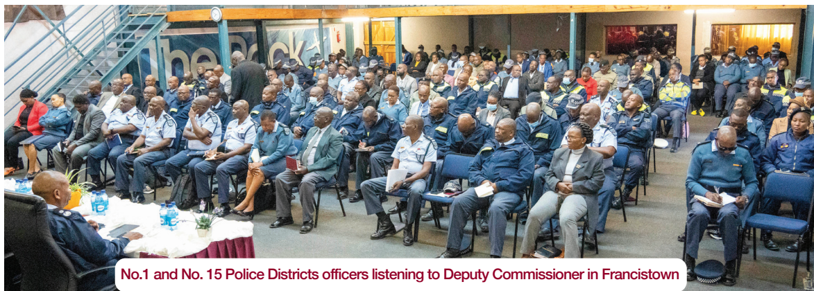
No.1 and No. 15 Police Districts officers listening to Deputy Commissioner in Francistown

The Deputy Commissioner concluded his trip by visiting the border line between Botswana and Zimbabwe at Mapoka village to appreciate challenges police officers go through in their efforts to combat cross border crime.