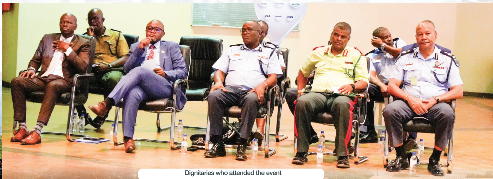
Dignitaries who attended the event

The CPU is operating under Special Support Group (SSG) branch.