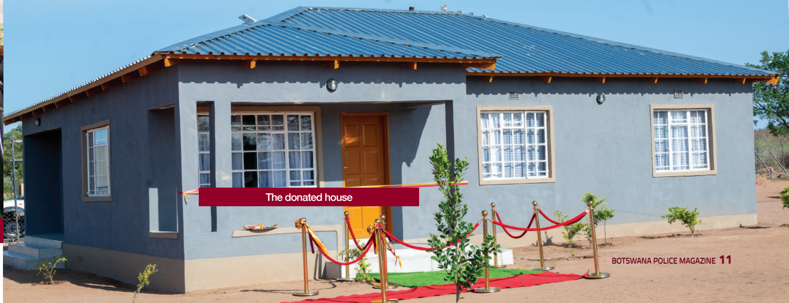
The donated house

and generosity are virtuous and bring blessings or positive outcomes to the giver. He further emphasised the idea that helping others, whether through charitable acts, kindness or support is a noble and rewarding endeavor, stating that giving does not only benefit the recipient but also brings a sense of fulfilment and positivity to the giver.