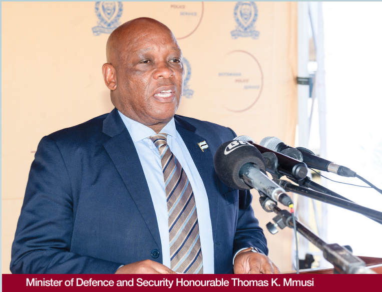
Minister of Defence and Security Honourable Thomas K. Mmusi