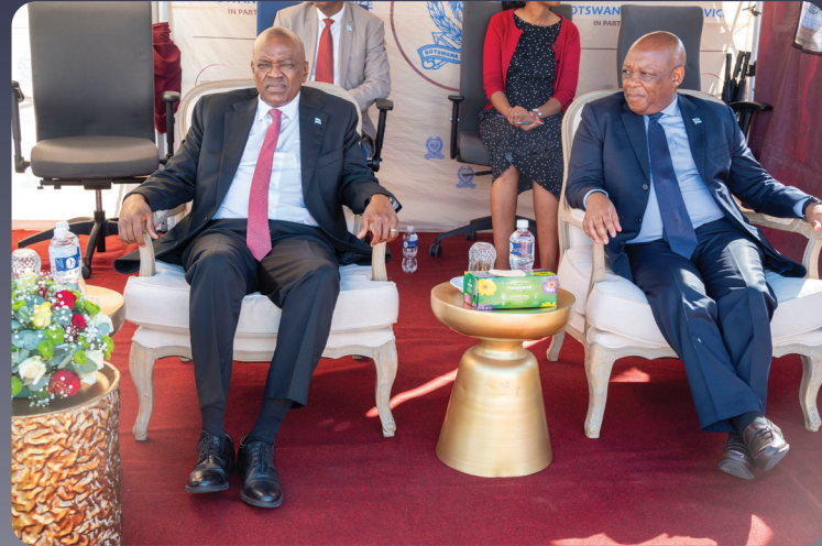
His Excellency the President, Dr Mokgweetsi E. K. Masisi (L) and Minister of Defence and Security Hon. Thomas K. Mmusi (R)