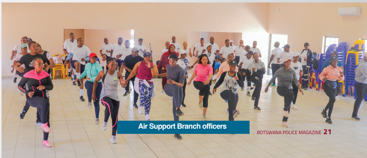
Air Support Branch officers