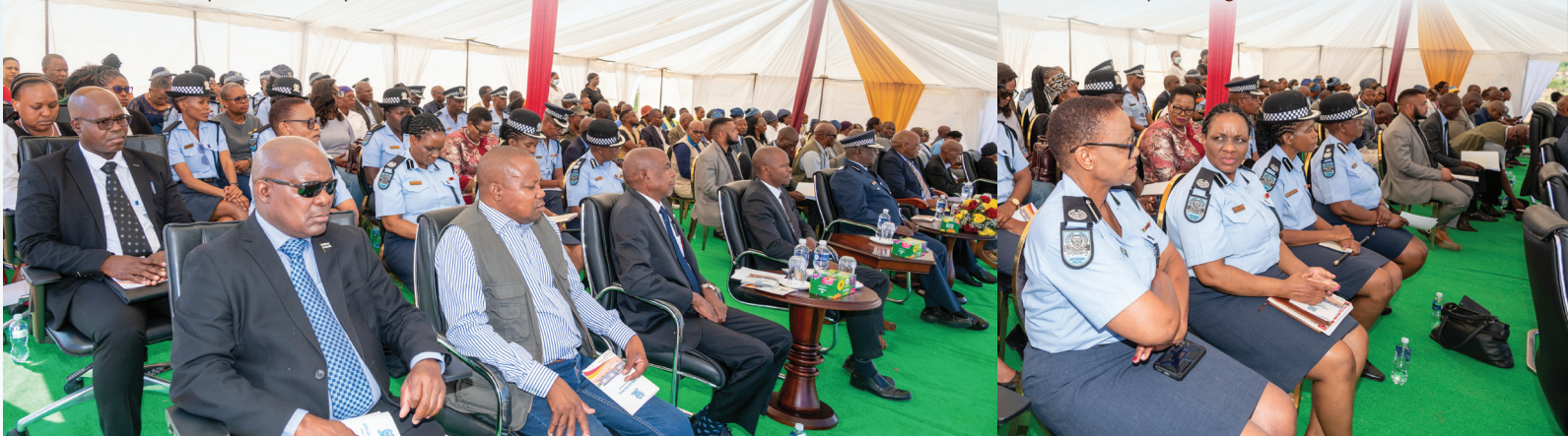
Some of the dignitaries who graced the event

The Minister went on to encourage the Police to continue protecting Batswana from criminal